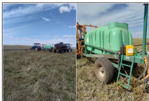
Fig. 1: Application of organic fertilizers on naturally degraded pastures (a: The spraying process; b: pouring the mixture into the sprayer)

The soil of the experimental site is represented by chernozem with a humus content below average and low moisture retention capacity. The humus content was 4.7% and the amount of easily hydrolyzable N in the soil reached 41.0 mg/kg. The level of mobile phosphorus was estimated at 15.0 mg/kg of soil and exchangeable potassium at 350 mg/kg. The pH of the soil, measured at 7.3, indicates a neutral reaction in the soil environment.