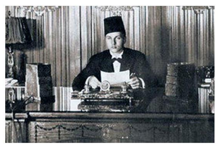
Fig. 3: King Farouq, May 8, 1936