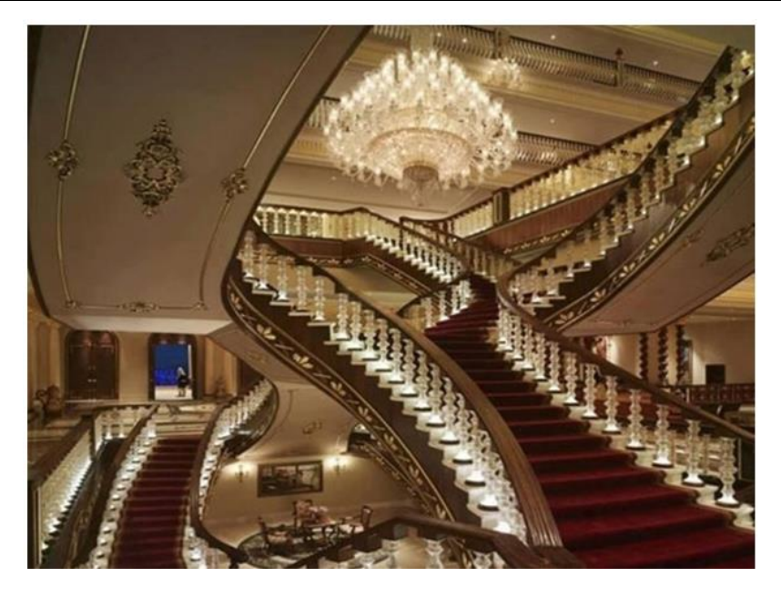
Fig. 4: The Staircase in the Palace of the Dome

There is more than one reason for the Ottman's invasion of Egypt including the adjacency of the two countries and the Ottman's conquest of Europe became fulfilled so they wanted to head west to perform their religious duty, to face the countries of Purism and Shiism and to protect the Islamic holies in Al-Hejaz from the Portugese especially after the weakness of Al-Mamluks in Egypt. They conquered it after the defeat of Sultan Qansawi Al –Ghouri in the battle of Marg Dabiq, presently in northern Suria (Abdel-Razeq Eissa, 1997, pp. 66-67).