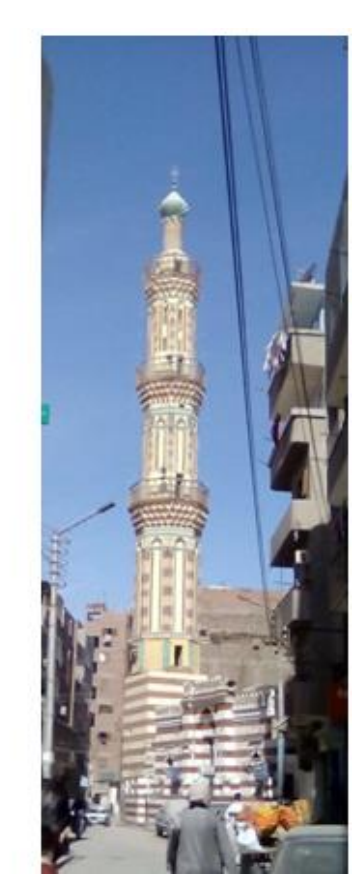
Fig. 6: El-Megahdeen Mosque (left) and El-Amawy Mosque (right) in Old Assiut