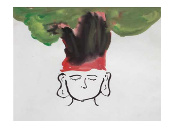
Fig. 9: Meditation

It represents a girl's pain, tears suppressed for so long, are now blood. The hammer is a representation of all the forces surrounding her, reducing her space...... which is so small, that it now confides only to her heart, she's succumbing to it..... and "It's killing".