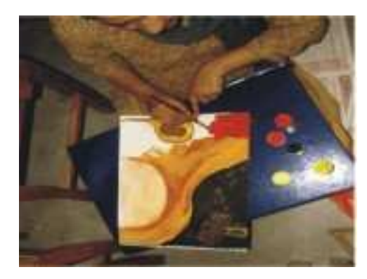
Fig. 5: The subject creating Fig. 6

Example-1: The subject (Fig. 3) who created Fig. 4 writes: "I've shown a kind of freedom which I felt during painting. I've shown myself with my child. My child is always present at the back of my mind, trying to nurture him with warmth and care just like the shade from a tree".