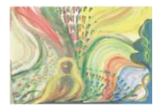
Fig. 4: Mother and child