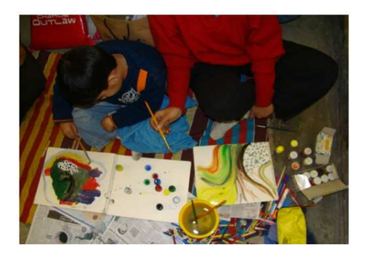
Fig. 3: The subject creating Fig. 4

In the beginning of the workshop, during the discussion, the subjects shared that they were not able to think beyond the conventional forms of mountains; huts; sceneries with a boat and sun; and conventional geometrical or floral designs. But, it was analyzed from their works (which they did after discussions, viewing of slides and silently listening to music) that they were able to think beyond the conventional ideas and they expressed what they really felt and experienced. This is reflected in the following examples of the paintings (Fig. 4, 6, 8 and 9) done by the subjects. The subjects, also, shared the idea behind their work of art.