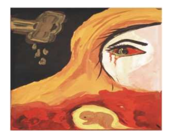
Fig. 6: Women's struggle