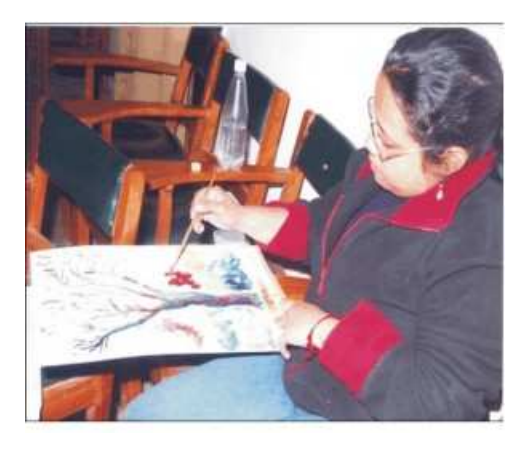
Fig. 7: The subject creating Fig. 8