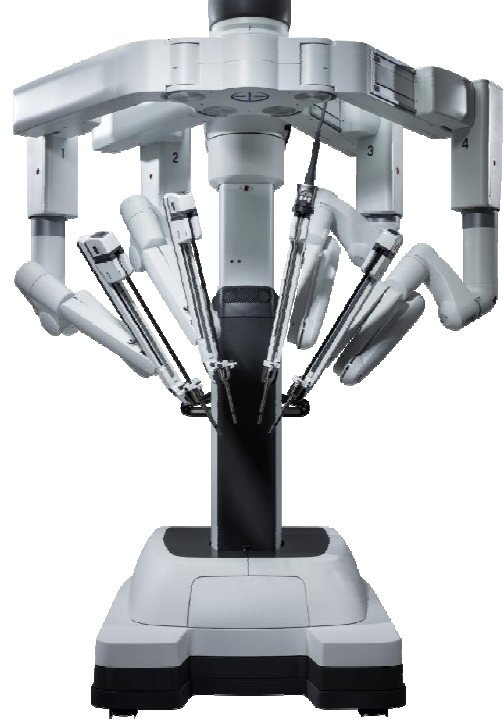
Fig. 3: Robotic surgery DaVinci system

The da Vinci Surgical System (sic) is a robotic surgical system made by the American company Intuitive Surgical. Approved by the Food and Drug Administration (FDA) in 2000, it is designed to facilitate complex surgery using a minimally invasive approach and is controlled by a surgeon from a console (Fig. 2a and 2b), (Da Vinci Surgical System, From Wikipedia). The system is commonly used for prostatectomies and increasingly for cardiac valve repair and gynecologic surgical procedures. According to the manufacturer, the da Vinci System is called "da Vinci" in part because Leonardo da Vinci's "study of human anatomy eventually led to the design of the first known robot in history", (Akubue, 2011).