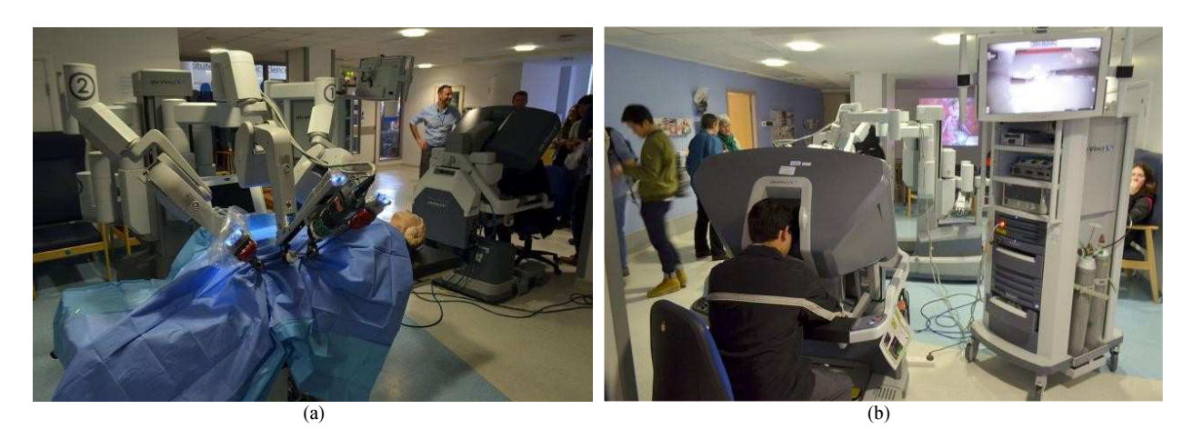
Fig. 2: (FDA) for use in laparoscopic surgery (a) Da Vinci patient-side component (left) and surgeon console (right) (b) a surgeon console at the treatment centre of Addenbrooke's Hospital

The first surgical robot called da Vinci, in honor of Leonardo da Vinci, was developed in Silicon Valley by Intuitive Surgical and in 2000 he obtained the authorization of the American Food and Drug Administration (FDA) for use in laparoscopic surgery.