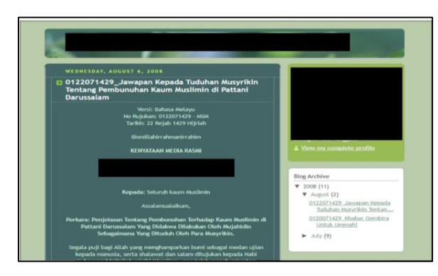
Fig. 1: Surface ideology of group 1 media publication

Osman Khairunnisa et al. / Journal of Computer Science 2024, 20 (6): 610.627 DOI: 10.3844/jcssp.2024.610.627