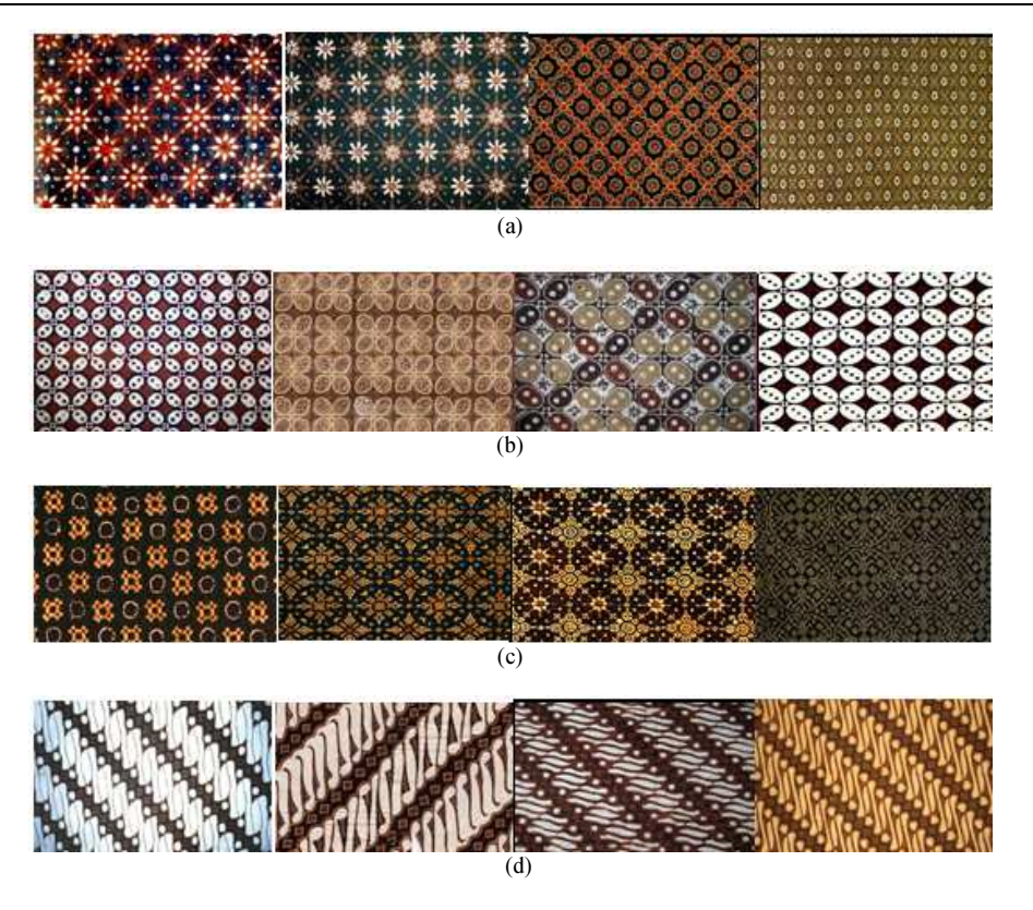
Fig. 1: Examples of traditional batik motifs (a) ceplok (b) kawung (c) nitik (d) parang

The performance of a combination of mean, energy and standard deviation as features has been compared and the use of energy and standard deviation is the best combination of image feature (Kokare et al. , 2003). Standard Deviation (STD) is used as a feature of every image since it can show a distribution of grey intensity; the lower STD value the more average distribution. The higher energy value as an image feature shows variation of texture elements (texel) with white color which is more dominant and the distribution of gray level/ the image structure becomes more irregular. The lower value shows variation of texel with black color which is more dominant and the distribution of gray level/the image structure becomes more regular.