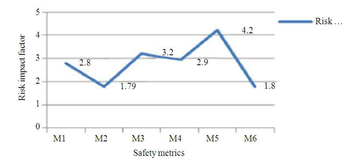
Fig. 5. RCCS metrics results