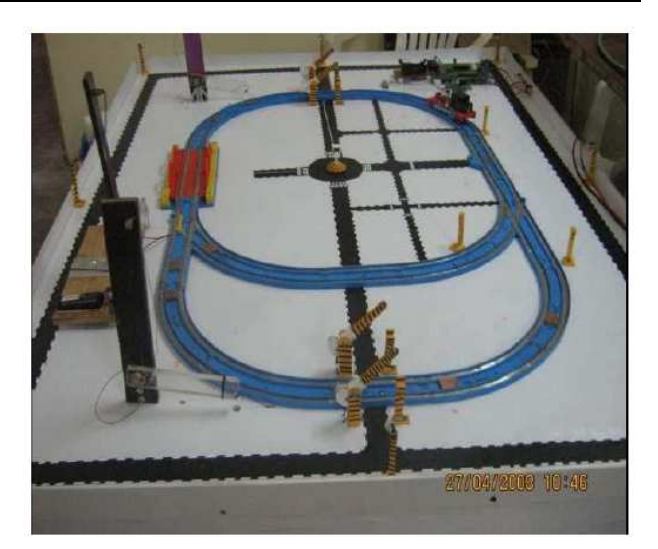
Fig. 3. Prototype of RCCS

Controller: Controller controls the activities of lowering and raising the gates with respect to the presence and absence of the train respectively. Sensor no.1 is responsible for lowering the gates and sensor no.2 for raising the gates. This activity is done by the controller which is actuated by the signal from the sensors. AnIBM compatible PC is nominated as the controller for RCCS. The DIO card receives the inputs from each of the ninesensors of RCCS. The eight output signals sent from DIO card control the following: The power supply to the train track, power supply to the two gate assemblies, power supply to muscle wire based mechanism to change the track lever and four signal lights.