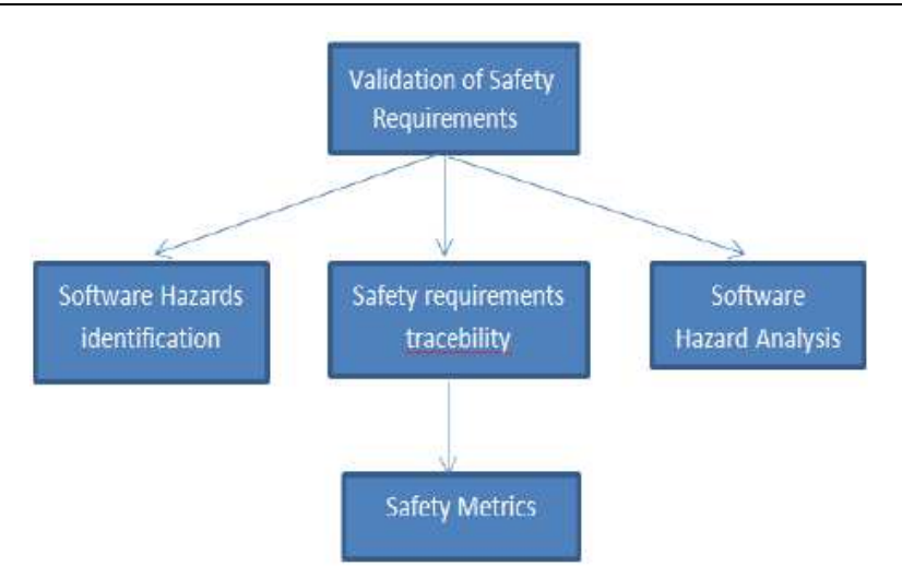
Fig. 1. Validation of software safety requirements

Kotti Jayasri and Panchumarthy Seetharamaiah / Journal of Computer Science 2015, 11 (6): 813.820 DOI: 10.3844/jcssp.2015.813.820