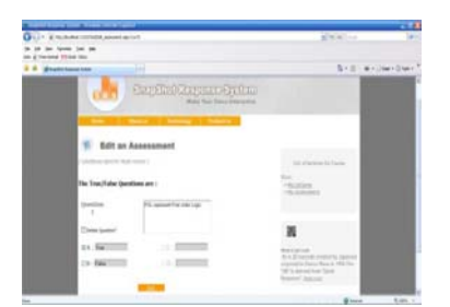
Fig. 4: Creating assessment