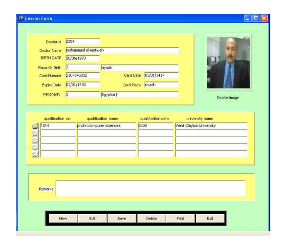
Fig. 8: Doctors registration form