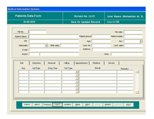
Fig. 4: Patients data form