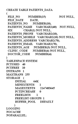
Fig. 5: Patients table in oracle SQL

Figure 5 an example for one of the tables used Patients Table in Oracle SQL. Figure 6 Primary key, unique constraints. Figure 7 Patients_Data Table unique Index constraints. Figure 8 Doctors registration form.