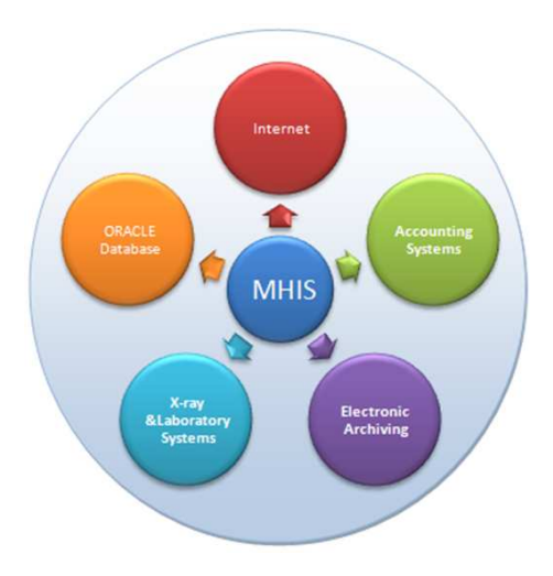
Fig. 2: System processes

The eighth phase is concerned with developing medical information systems to cope up with enormous developments in IT domain. Fig.1 flow chart for following up health operations concerned with patients, Fig. 2 processes of information systems to internal systems of hospitals, Fig. 3 Analysis Types Report (Laboratory). Figure 4 Patients Data Form and new file entry and opening.