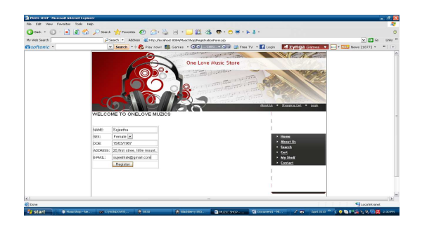
Fig. 5: Expected web page in desktop