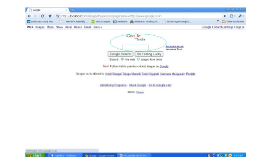
Fig. 3: Formatted page with unwanted content

The expected adapted web page given below (Fig. 3) represents the adapted page without removing the unwanted content in the desktop. The Fig. 4 represents the adapted page without removing the unwanted content in the mobile which leads to a messy look. The user finds difficulty in reading this. The Fig. 5 represents the final adapted page in desktop. The Fig. 6 represents the final adapted page in the mobile with necessary contents.