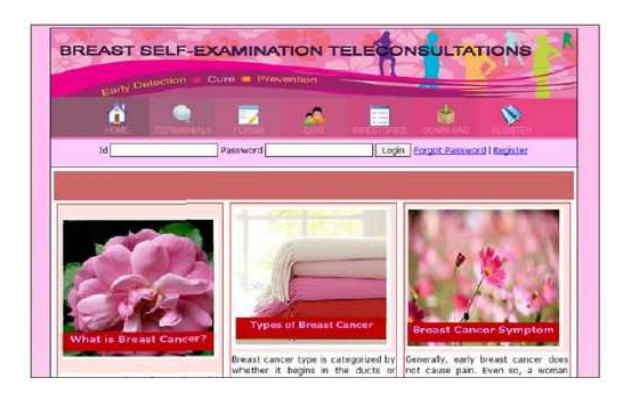
Fig. 3: The main page of the system