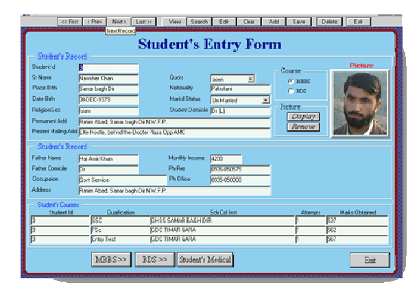
Fig. 2: Student registration information