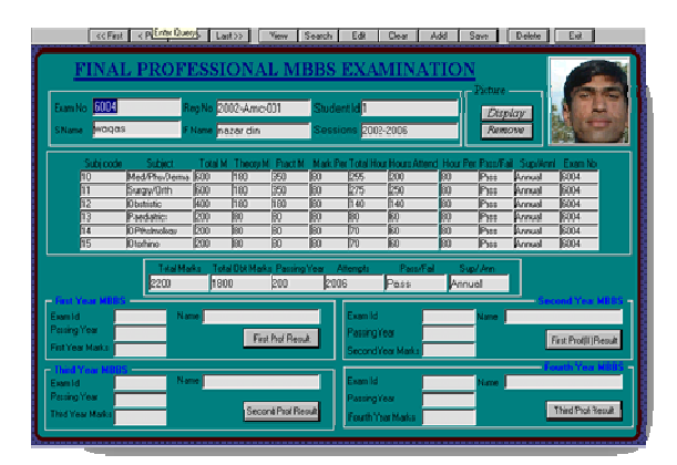
Fig. 3: MBBS examination information

BDS: It has four modules further. As such the MBBS modules these modules also provides insertion, modification, searching and deleting a record. AMCSIS support the user to display specific report for a specific student and also can generate and display the report with initial medical record and entry record during admission. User can retrieve report with detail of many professional Exams as shown in Fig. 4.