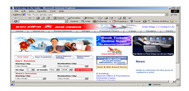
Fig. 4: Home page of Air India website