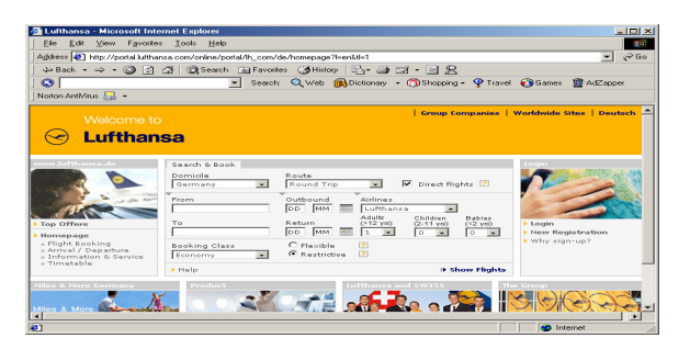
Fig. 3: Home page of Lufthansa airlines

These remarks were then used to compare with the actual results on the trust computed by the algorithm.