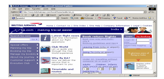
Fig. 5: Home page of British Airways website

Table 5 lists the user consensual opinion regarding the feature state for the features of each of these websites.