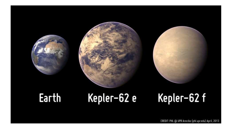
Fig. 2: Kepler 62 e and f and Earth