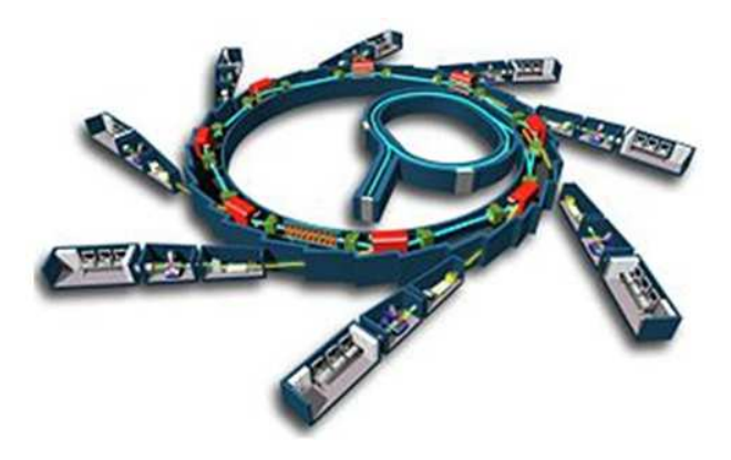
Fig. 1. A high energy synchrotron schema

The design of an LINAC depends on the type of particle filter, which is accelerated: The electron beam protons or ions. It is suggested to use a powerful LINAC at the outlet of the synchrotron (especially when one accelerates the electrons) is not wasting energy photons of premature emission (Fig. 1 and 2). One can use a LINAC in entry into synchrotron and another one at the output (Fig. 1 and 2). To use a LINAC low input (between him and synchrotron) one put it on a speed circuit of the additional, in a form of a stadium (Fig. 1 and 2), (Petrescu, 2009; Petrescu and Calautit, 2016; Petrescu et al. , 2016).