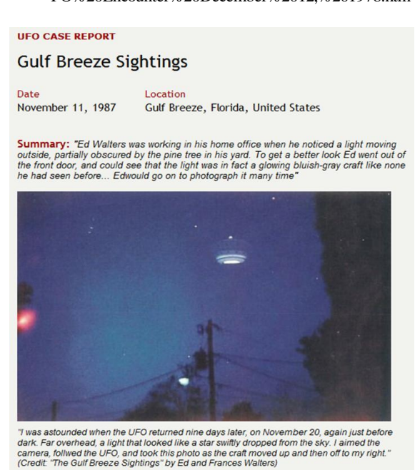
Fig. 8. 1987, UFO over Gulf Breeze, Florida, US

Obviously, if today we can't create and build performance particles accelerators, not even stationary, the ships of this kind were not terrestrial, the more that they could be seen from ancient times, that is when man still did not know how to fly.