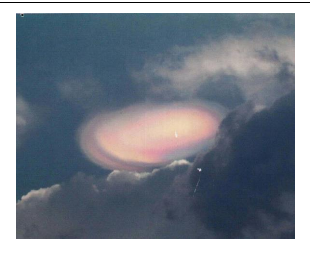
Fig. 1. Unusual atmospheric occurrence observed over Sri Lanka in 2004.

The gap left by the lack of institutional science research has given rise to researchers and independent groups, including the NICAP in the mid-twentieth century and more recently to the UFO Mutual UFO Network and the UFO Study Center (Center for UFO Studies). The term "UFOlogy" is used to describe the collective efforts of those studying the reports and evidence associated with unidentified flying objects.