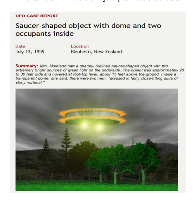
Fig. 4. 1959, Fly saucer reported in Blenheim, New Zealand.