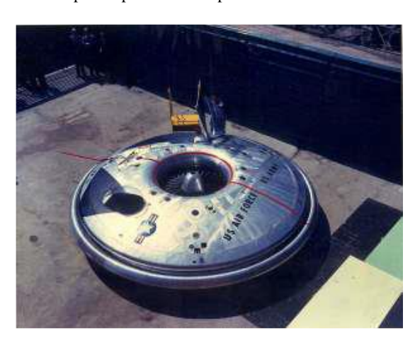
Fig. 12. The Avro Canada VZ-9 Avrocar was a VTOL aircraft developed by Avro Aircraft Ltd. (Canada). The Avrocar intended to exploit the Coanda effect to provide lift and thrust from a single "turborotor" blowing exhaust out the rim of the disk-shaped aircraft to provide anticipated VTOL-like performance.

Another important observation is that after the Second World War we started to build modern flying ships with many capabilities that can easily be confused with an alien ship (Fig. 12).