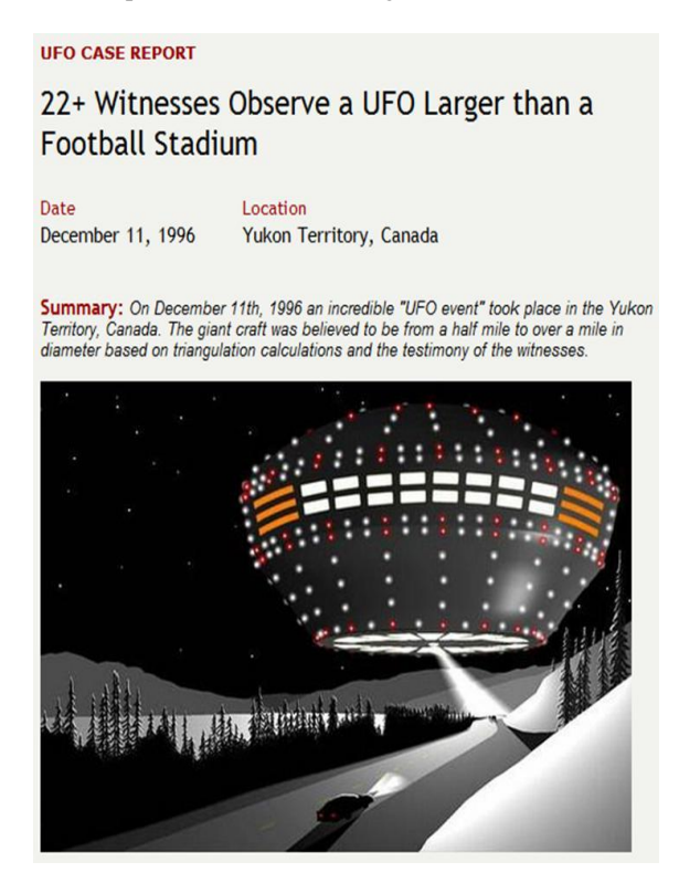
Fig. 10. 1996, UFO over Yukon Territory, Canada.

An important observation is that aliens have evolved along with their flying boats, which over time have had more and more modern and dynamic aspects.