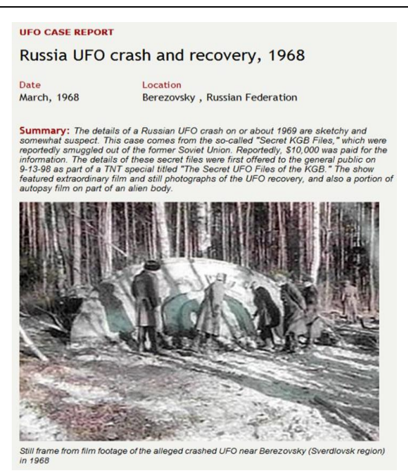
Fig. 5. 1968, Russia UFO crash in Berezovsky

Unfortunately, the physics we master today does not allow us to build such super-performance accelerators.