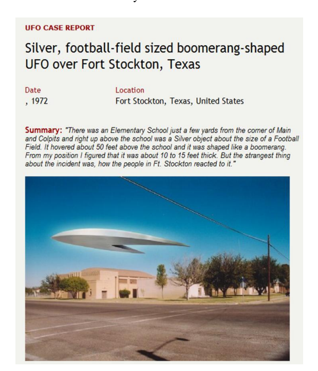
Fig. 6. 1972, UFO over Fort Stockton, Texas.

Until we master an advanced technique up to such a level, we can replace particle accelerators with very high-power lasers and repeated impulses at extremely low intervals.