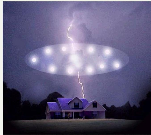
FAIR USE NOTICE: This page may contain copyrighted material the use of which has not been specifically authorized by the copyright owner. This website distributes this material without profit to those who have expressed a prior interest in receiving the included information for scientific, research and educational purposes. We believe this constitutes a fair use of any such copyrighted material as provided for in 17 U.S.C.§ 107.

Summary: The luminous spheres during the storm were described as a "very large object hovering over a nearby house about an 1/8 of a mile from our house. It was larger than the house, seemed to be at an angle to her view with the bottom exposed and had lights all around it evenly spaced."