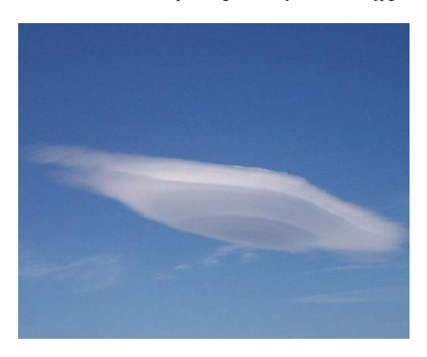
Fig. 2. Lenticular clouds have in some cases been reported as UFOs due to their peculiar shape.

UFOs have become a dominant theme in modern culture, making phenomena treated from a sociological and psychological point of view.