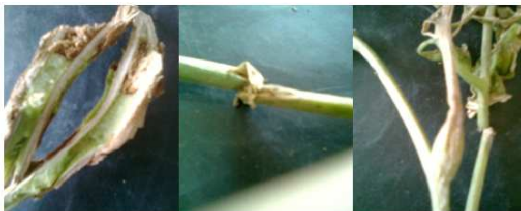
Fig. 2. Infected vascular stems tissues with mealy appearance of vascular parenchyma

Each treatment replicated three times and left in green house to evaluation disease severity depending on the scale of (Foster and Echand, 1973) as follow degrees: