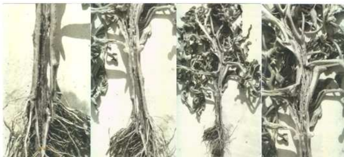
Fig. 1. Stem canker and pith necrosis symptoms