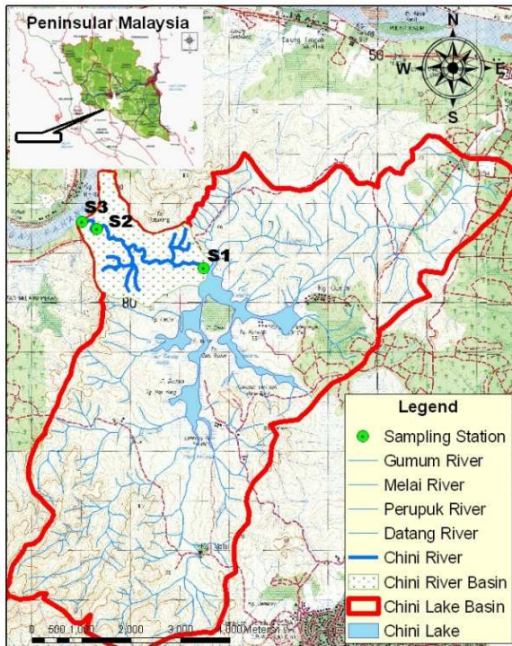
Fig. 1: Location of sampling stations at the Chini River

Sediment samples were also collected using sediment scoops. Three sample replications were collected from each station and the finding was presented by the average of the replicated samples. The cross-section length and water velocity were also measured at each station using several types of apparatus such as the flow meter, depth measuring gauge, measuring tape and poles. The samples collected were analysed in the laboratory.