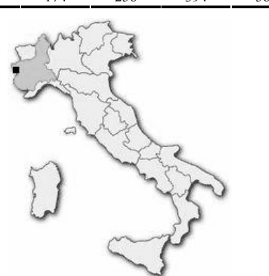
Fig. 2: The localization of Cesana Torinese.

On the basis of these considerations, the case study of the municipality of Cesana Torinese, an important ski resort in North West Italy which borders on France (Fig. 2), offers some interesting points of reflection concerning an innovative application of ISO 14001 and the EMAS regulation. Cesana Torinese is a mountain municipality that is characterised by an important tourist value and a remarkable territorial extension (121.3 \text{ Km}^2) in comparison to only 955 residents, a number that undergoes sudden increases in the winter periods when huge tourist flows determine an increase in number of up to 18,000 units. The Cesana Torinese municipality has been ISO 14001 certified since 26 January 2001 and EMAS registered since 26 May 2003. It can be considered a model to evaluate the results that have been reached, and which can be reached, with environmental certification. It also represents an important example of how such an eco-management scheme can efficiently respond to the requirements of an administration, even when this is called upon, after a system has been implemented, to respond to relevant modifications to the scenario of competence, such as the planning and management of the Turin 2006 XX Winter Olympic Games (which was only a hypothesis at the moment of certification), which led to relevant modifications of the infrastructural layout of the municipality and an important increase in the number of tourists throughout the territory.