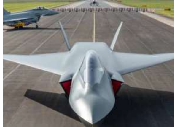
Fig. 19: Tempest sixth-generation jet fighter will have high-speed radar, Artificial Intelligence (AI)

Officials of the U.S. Defense Advanced Research Projects Agency (DARPA) in Arlington, Va., announced a $2.3 million contract to PhysicsAI earlier this month for the Air Combat Evolution (ACE) Technical Area 1: Build Combat Autonomy project.