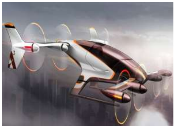
Fig. 1: The aircraft called the alpha one

The main innovation in the production of the aircraft will be the design of three engines: Two are located under the wings of the aircraft, the third in the tail. This arrangement will positively affect both the speed and aerodynamics of the future airliner. It is worth noting that Lockheed Martin engineers presented such a design in 2014, but only now has found a worthy application. In addition, the aircraft cabin will be made according to all standards corresponding to the premium segment and the flight from Los Angeles to Sydney, according to the creators, will take only two hours for the aircraft.