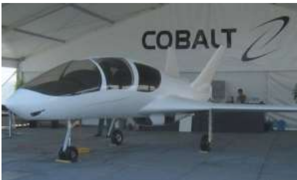
Fig. 10: The new private jet, the Cobalt Co50 Valkyrie