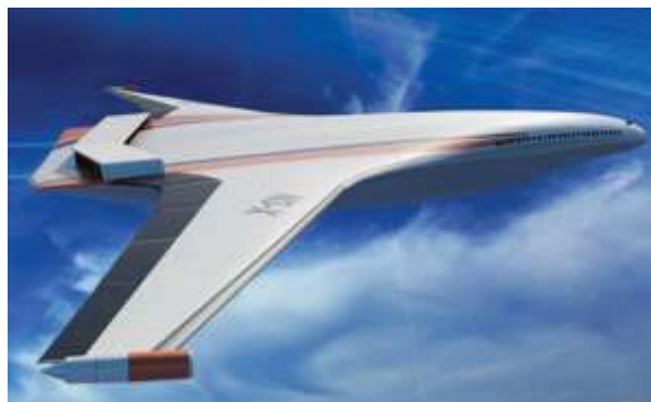
Fig. 5: Airbus is testing a small but completely electric Airbus-E-Fan

But many aircraft manufacturers have no doubt that the future belongs to electric aviation, or at least they want it, being an important goal, even an international directive. For a start, it is planned, as in cars, to make a hybrid engine. Airbus intends to test a "more electric aircraft" as part of the DISPERSAL project in 2022. The contribution of the electric fan motor to the total force should be 23%.