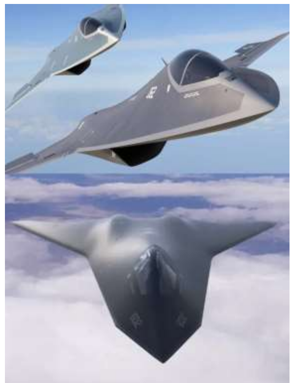
Fig. 31: The US top-secret sixth-gen fighter. It has Laser shooting weapons

The US top-secret sixth-gen fighter has Laser shooting weapons.