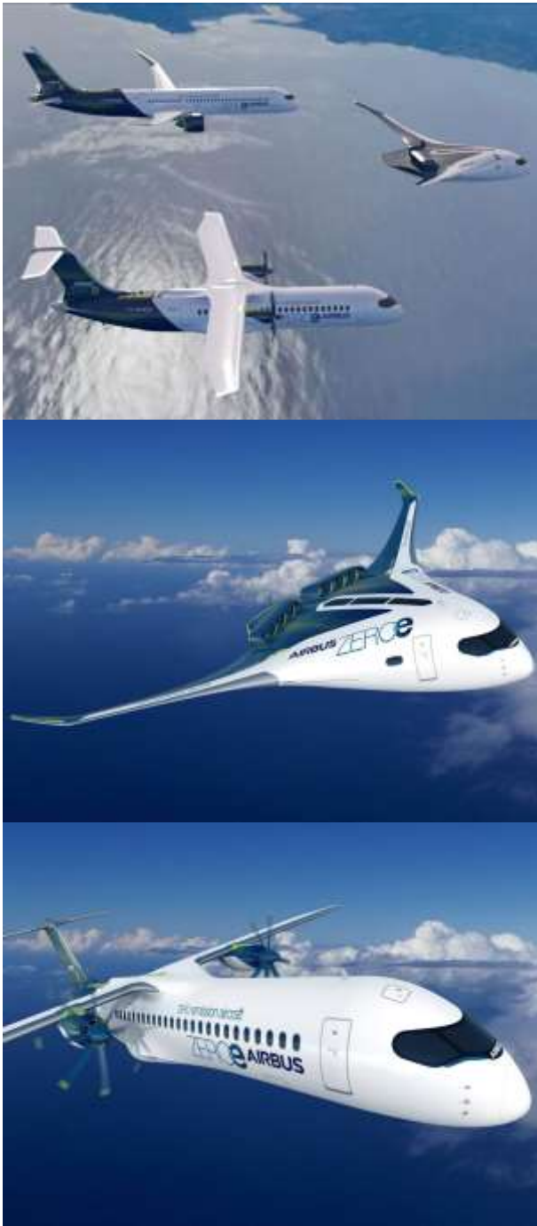
Fig. 21: The project includes a hydrogen turbofan, which is rotated by a modified gas turbine engine

Airbus hopes to spark enthusiasm with these launches around the idea of powering tomorrow's aircraft using hydrogen gas. "The transition to hydrogen, as the primary source of energy for these concept aircraft, will require decisive action from the entire air ecosystem," said Guillaume Faury, CEO of Airbus.