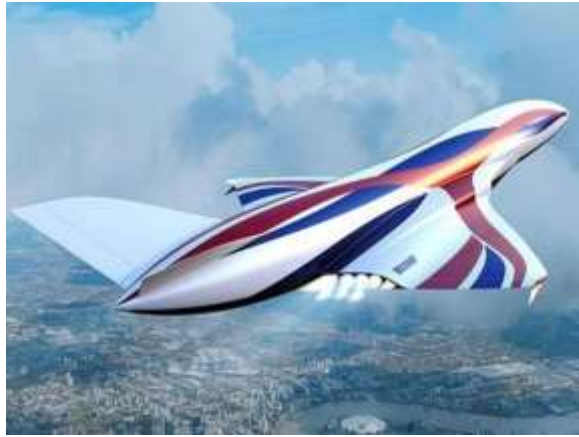
Fig. 45: British could arrive in New York in just an hour's flight with a plane powered by new technology

The engine is nicknamed the Engine of the Synergistic Breaking Air Missile (SABRE) and "represents a defining moment in motor flight". It will also power spaceships.