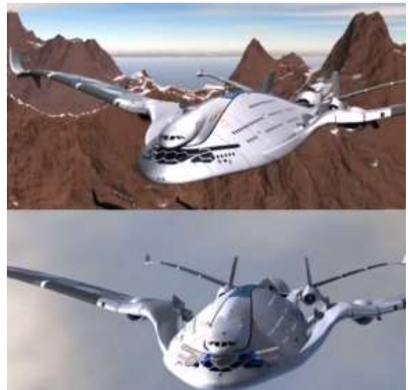
Fig. 30: The progress Eagle

The US says it has tested a top-secret sixth-gen fighter. The aircraft was created using digital engineering, which allows the service to bypass the regular manufacturing process (Fig. 31).