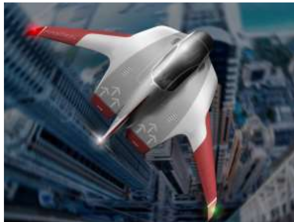
Fig. 25: The Pipistrel 801 eVTOL

The paper leverages the efforts of a separate Mahepa project, led by Pipistrel, which develops and tests various new propulsion technologies, including electric fuel cell and hydrogen propulsion systems. The Pipistrel team hopes to start testing the flight of a prototype for this design before the end of 2020.