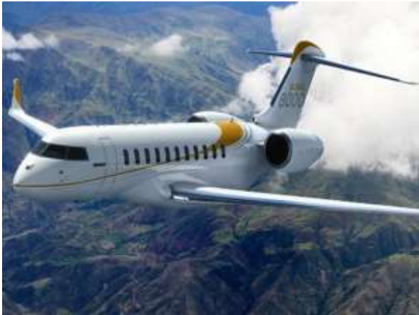
Fig. 9: Bombardier Global 8000

The new private jet, the Cobalt Co50 Valkyrie (Fig. 10), is cheaper than the competition ($ 600,000) and is the fastest in its class, but its main design innovation is that it looks exactly like Bruce Wayne's plane. It can carry up to 5 passengers at a time.