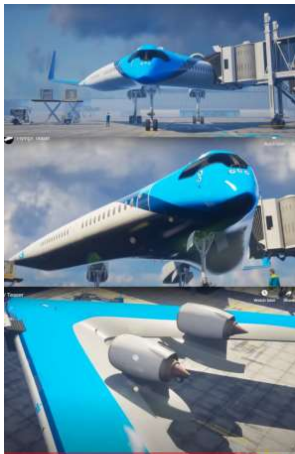
Fig. 26: The Flying-V concept