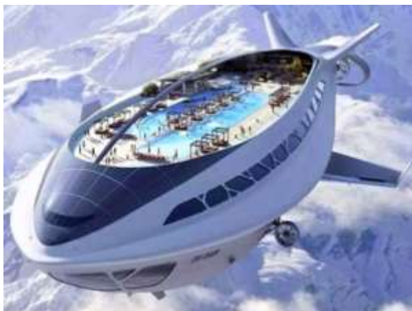
Fig. 39: The most expensive Private Jets in the world