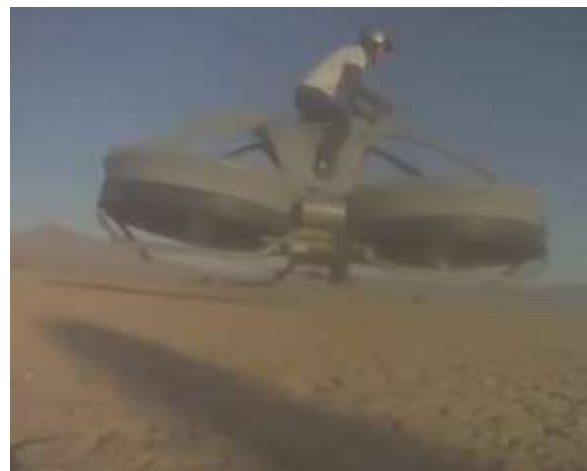
Fig. 37: The flying bike

The flying mansion (Fig. 38) is designed in such a way as to become a flying house, or rather a flying palace, being equipped with lounges, bathrooms, kitchen, living room and luxurious bedrooms, swimming pool and practically everything comfort desired by anyone, being one of the largest flying vehicles currently available, with great comfort, extraordinary safety, easy maintenance in the air, low fuel consumption, it can be designed with zero emissions, only with electric motors.