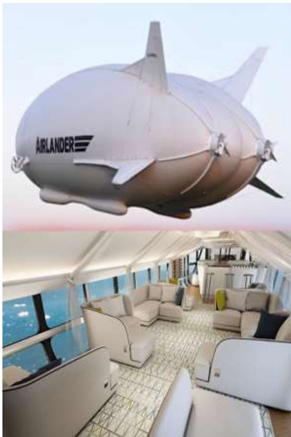
Fig. 38: The flying Mansion