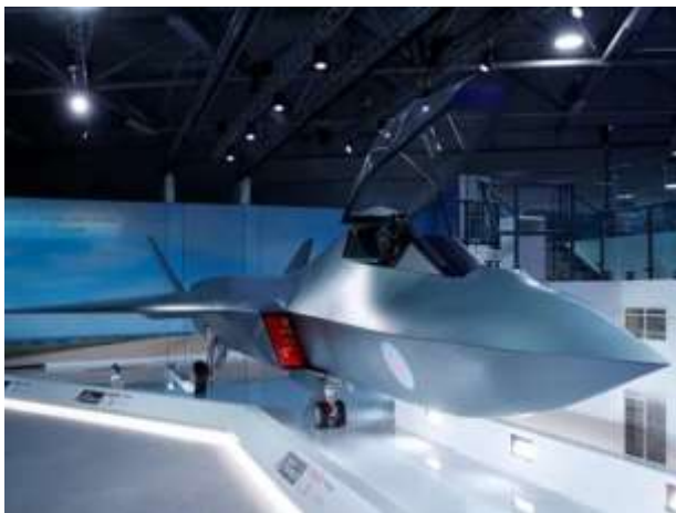
Fig. 43: A model of the Tempest jet fighter, unveiled by the defense secretary, Gavin Williamson, at the Farnborough airshow

EADS has thought of building the Voltaire project with two large batteries, each with a very high density, which is positioned in the hold so that they can be easily changed when the plane arrives at an airport. The discharged batteries will then be returned to a charging station in the same way that cargo and luggage are removed from an aircraft - a set of fully charged batteries to be replaced so that the aircraft does not waste time waiting to charge the batteries, so they are very easy to replace, wherever the plane will land. The rear propulsion system together with electric motors achieves great fuel economy, eliminates the huge noises of propulsion on classic fuels, fossil fuels, eliminates environmental pollution with already known classic pollutants that have completely destroyed nature's ecosystems thus achieving all dreams of humanity to fly smoothly without noise and noxious substances, without environmental pollution, without stress and in great safety, with a much high quality of flight. The proposed system aims to bring with it the success that the industry has had in the last 10 years and the batteries they need - 1000 Wh/kg - in no more than 20 years, which would completely change the way they fly.