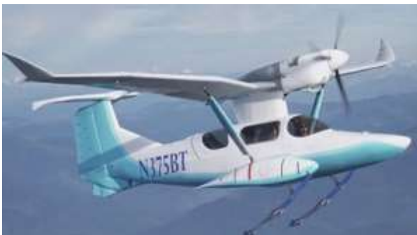
Fig. 11: The private SkiGull amphibious aircraft

The private SkiGull amphibious aircraft (Fig. 11) will be able to land not only on water but in general on any surface (grass, snow, ice). It made its first flight in November 2015 and will be on sale soon.