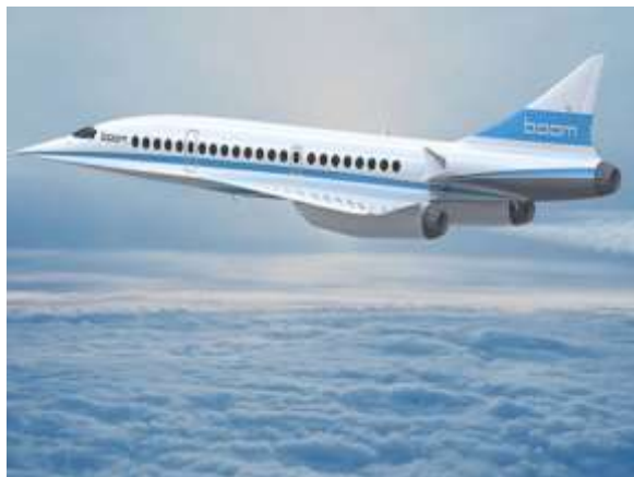
Fig. 4: XB-1 supersonic demonstrator

"I have long been passionate about aerospace innovation and the development of high-speed commercial flights. Virgin Galactic is a space innovator and it was easy for them to decide to work with Boom," says Richard Branson.