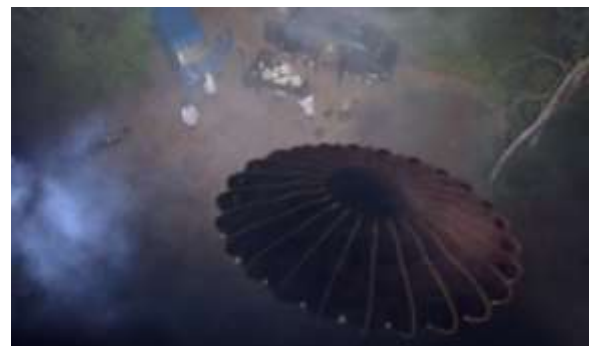
Fig. 50: A top secret US laser aircraft