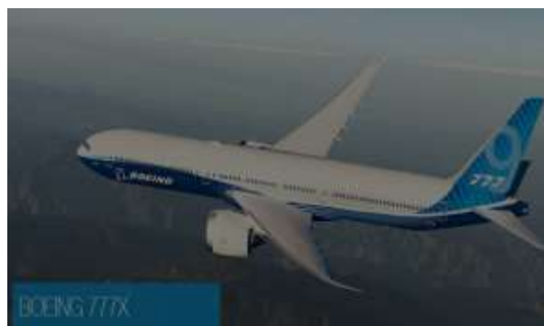
Fig. 8: The Boeing 777X

The 8-passenger Bombardier Global 8000 business jet will be able to fly a record 14,600 kilometers without refueling at an average speed of 956 km/h (Fig. 9).