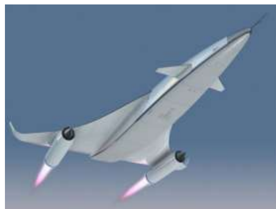
Fig. 41: Reaction Engines testing ammonia as carbon-free aviation fuel

Reaction Engines testing ammonia as carbon-free aviation fuel (Fig. 41).