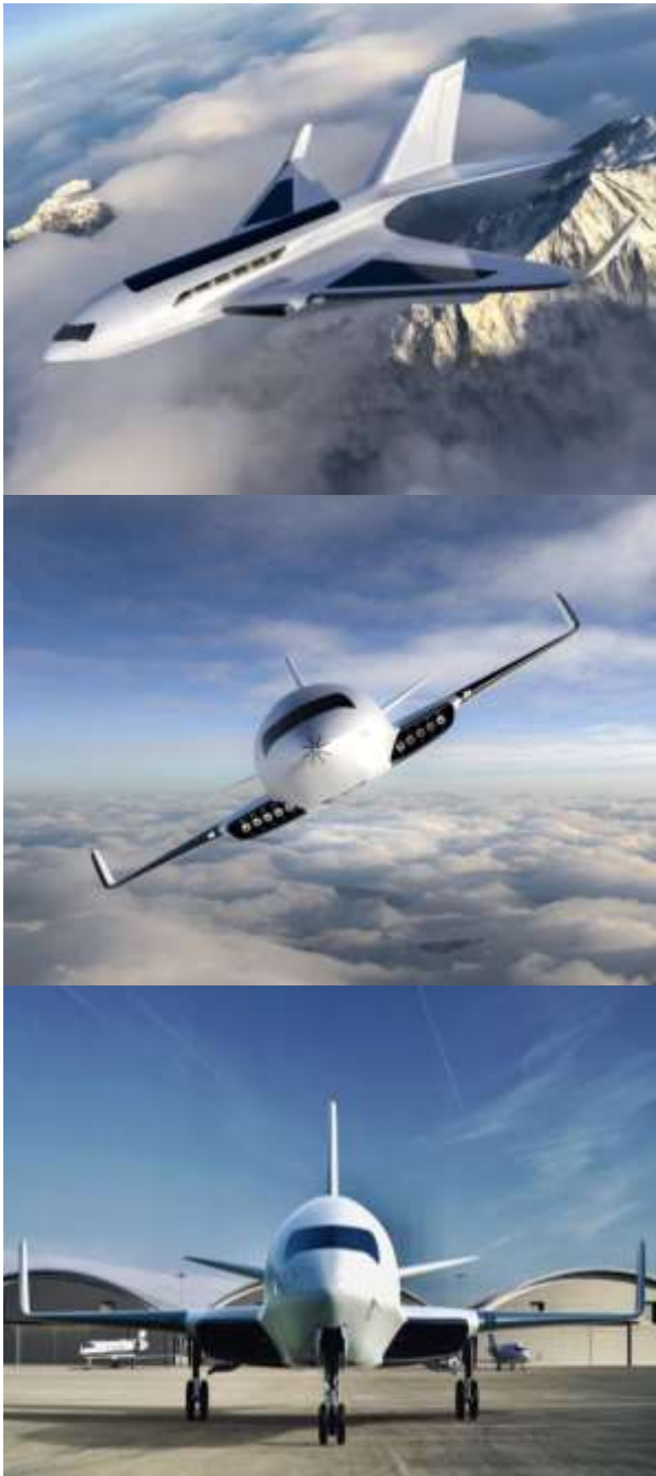
Fig. 48: Eather one will be powered by air friction over the wings and frame. This type of renewable energy on demand is a radical proposal

While the latest trend in business aviation is the creation of the next generation of electric and hybrid aircraft, a new type of space race could emerge if physics actually supports the theory behind Eather One.