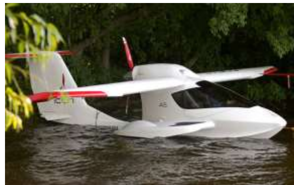
Fig. 12: The two-seater Icon A5

Another seaplane, the two-seater Icon A5, is capable of taking off and landing on water and can also come out of a spin and is equipped with a parachute for the entire aircraft (Fig. 12).