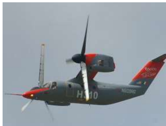
Fig. 15: The AW609 tiltrotor came closest to the creation of the VTOL transport