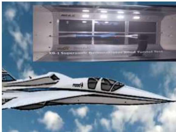
Fig. 29: The supersonic Baby Boom

Virgin Galactic is working with Richard Branson on Baby Boom, a new supersonic project that will fly from New York to London in just three hours, being a worthy successor to the Concorde due to its average supersonic speed of 2335 km/h (Fig. 29).