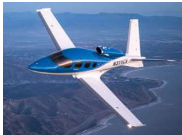
Fig. 13: The Cirrus Vision SF50 business aircraft