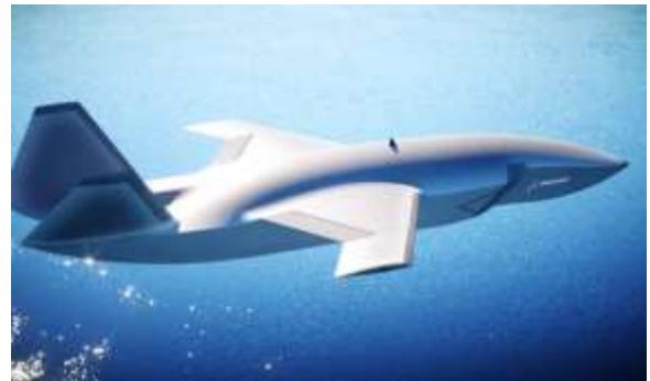
Fig. 20: Physical to develop Artificial Intelligence (AI) algorithms for high-performance unmanned combat aircraft

This project seeks to increase warfighter trust in combat autonomy by automating aerial within-visual-range maneuvering using realistic aircraft.