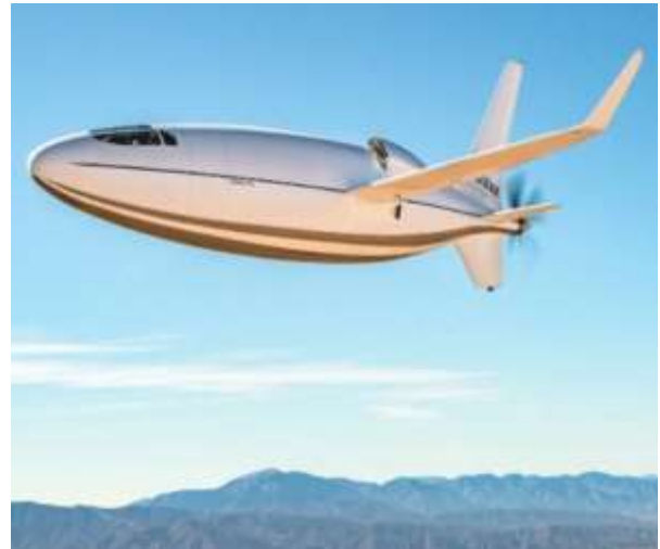
Fig. 22: The laminar-flow design of the Celera 500 L gives it a 4,500-mile range while its operating costs are about a sixth of competitive business jets

Airbus hopes to spark enthusiasm with these launches around the idea of powering tomorrow's aircraft using hydrogen gas. "The transition to hydrogen, as the primary source of energy for these concept aircraft, will require decisive action from the entire air ecosystem," said Guillaume Faury, CEO of Airbus.