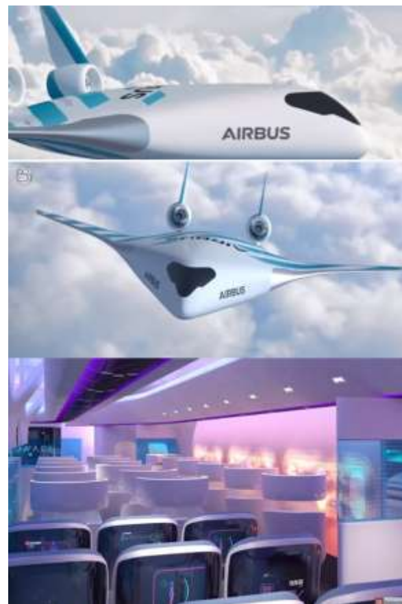
Fig. 27: The new Airbus Flying compact concept Maveric

Daniel's model already has this great advantage of its use at low costs for the manufacturer, user and passengers.