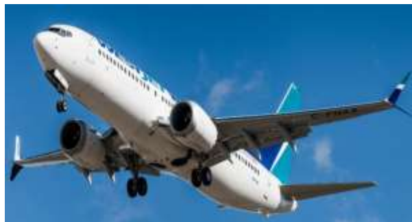
Fig. 7: The Boeing 737 MAX

The 737 MAX was banned from a flight on March 13, 2019, after the crash of an Ethiopian Airlines model that killed 157 people. The tragedy came just a few months after the disaster aboard a Lion Air MAX, which killed 189 people.