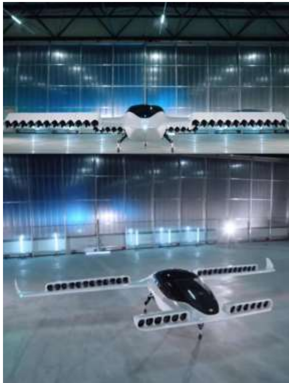
Fig. 28: The Lilium electric air taxi