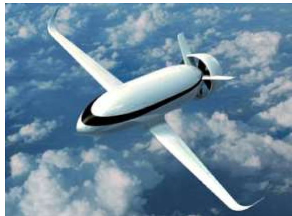
Fig. 44: EADS rethinks the way planes fly with new all-electric aircraft design

Flights could be very fast in the coming years, thanks to a very powerful new engine. The flight to New York could take just an hour and a trip to Australia could be completed in four hours with the new technology. The British company Reaction Engines is creating the super-engine that could see tourists throwing themselves around the world at full speed. The technology company said it intends to offer a "truly versatile propulsion system". It will be "an air-breathing hybrid rocket engine that can power an aircraft from a permanent start at a speed of sound five times faster for hypersonic flight into the atmosphere."