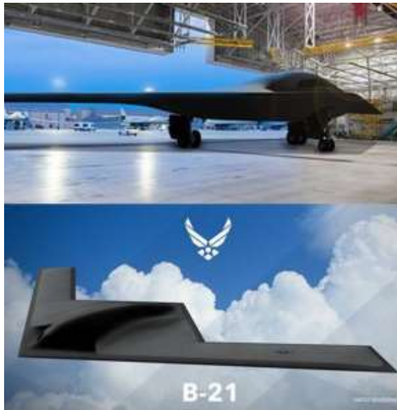
Fig. 34: A new presentation of a new development concept of the old B 21 Raider launched by the US Air Force (USAF)