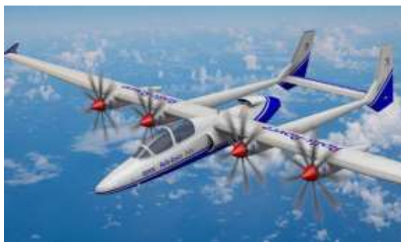
Fig. 35: APUS i-5 Rolling-Royce hybrid electric demonstration aircraft

The M250 hybrid package also complements systems developed for larger aircraft, as seen with the E-Fan X demonstrator