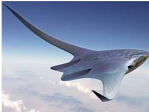
Fig. 42: A Voestalpine concept

At the 2011 Paris Air Show, aerospace giant EADS unveiled a fully electric propulsion system for a commercial aircraft that could be ready to fly in just 20 years. The aircraft, called the Voltaire, is a zero-emission, high-density, battery-powered aircraft that rethinks the design of conventional commercial aircraft to allow the change of the heavy-jet engine for an environmentally friendly battery system. The aircraft is powered by high-efficiency superconducting electric motors that operate reverse spiral propellers located behind the aircraft. The significance of this aircraft is not focused on the engineers' decision to sink a battery inside, but on the EADS team's understanding that in order to make electric airplanes a reality we will have to rethink not only engines but also aircraft propulsion systems and design (Fig. 44).