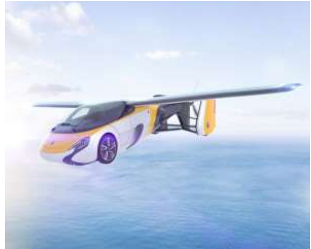
Fig. 3: A Skydrive

The maximum speed of Skydrive will be 100 kilometers per hour. The car will be able to take off at a height of 10 m. The car will also be able to travel on public roads.