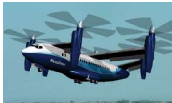
Fig. 40: Hexplane, a Six-Engine Airliner-Helicopter Hybrid

V-22 Osprey is a very bold futuristic concept imagined and thanks to today's drones with 3, 4, 5, 6, or n helicopter engines (Fig. 40).