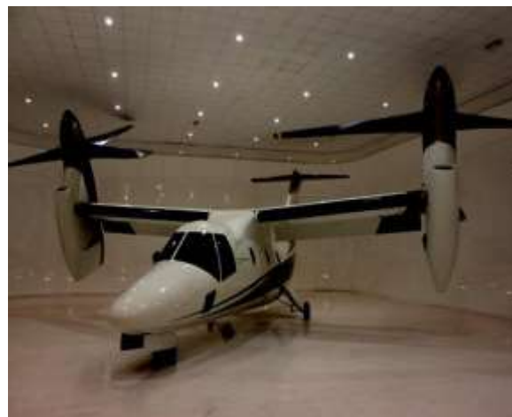
Fig. 16: The AW609

DARPA announced a competition to finally create a vertical take-off aircraft (Fig. 17) and 4 large corporations (Boeing, Aurora Flight Sciences Corp, Sikorsky Aircraft Co and Karem Aircraft) presented their full-size prototypes for testing in February 2017 (Council of the European Union, Policies. 2018).