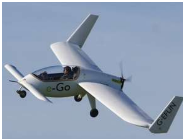
Fig. 14: The single-seater British e-Go jet is unique for its low price of only $ 70,000, cheaper than many cars

The purpose of the plane is to take off and land vertically, but to fly faster than a helicopter. More than 45 different aircraft flew proving the capabilities of VTOL and STOL, of which V-22, Harrier "jump jump", Yakovlev Yak-38 and Lockheed Martin F-35 Lightning II went into production. Until 2008, Bell estimated that very light aircraft and large offshore helicopters, such as the Sikorsky S-92, reduced the potential rotor market. Also in 2008, limited funding for the program by Bell and AgustaWestland was reported to have led to slow progress in flight testing. On September 21, 2009, AgustaWestland CEO Giuseppe Orsi said that parent company Finmeccanica authorized Bell Helicopter to buy the program to speed it up because Bell was unhappy with the business outlook and wanted to spend resources on other programs.