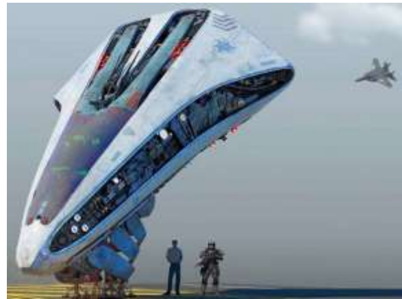
Fig. 36: A futuristic Flying Vehicle like in Star Wars is projected in secret for the US army (Fig. 36)

The flying bicycle can transport 2 people at 70 km/h, being a very small but powerful vehicle with enough autonomy to transport a passenger from one place to another, for rescue missions and quick evacuation (Fig. 37).