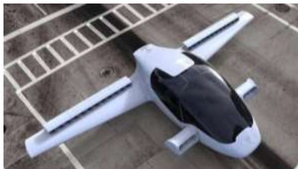
Fig. 6: NASA in 2016 announced the beginning of the development of the X-57 Maxwell aircraft equipped with 14 electric motors