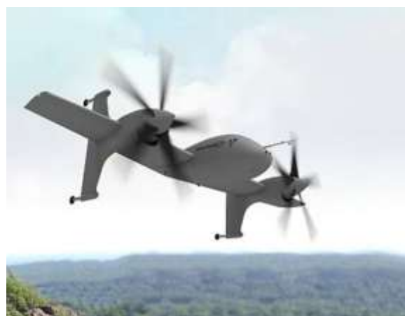
Fig. 17: The Sikorsky moves forward with DARPA VTOL X-Plane project to design new military tiltrotor aircraft