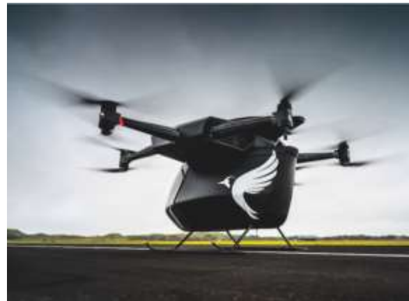
Fig. 33: The Vertical Aerospace's latest prototype, Seraph, can fly at speeds of up to 80 km/h and carry 250 kg, the equivalent of three passengers