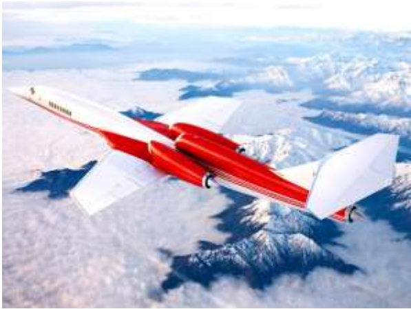
Fig. 2: Lockheed Martin is collaborating with Aerion on a new project and the new aircraft will be named AS2

The collaboration with Aerion was not accidental. The fact is that this company is one of the market leaders in the design of aerodynamic bodies, which is very important for any aircraft.