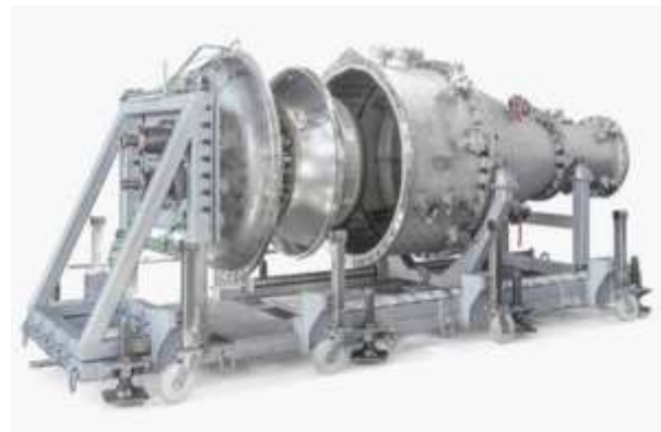
Fig. 47: SABRE engines are capable of Mach 5.4 in air-breathing mode and Mach 25 in rocket mode for space flight

Current jet engines can only power a vehicle up to Mach 3, three times the speed of sound, Reaction Engines explains on their website. A Mach number is a dimensionless quantity representing the ratio of flow velocity past a boundary to the local speed of sound.