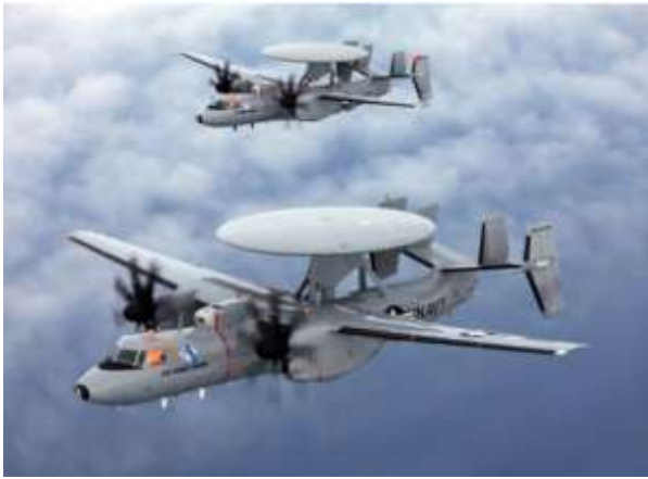
Fig. 18: Northrop Grumman upgrade E-2D flight computers to accommodate teaming among manned and unmanned aircraft

Northrop Grumman upgrade E-2D flight computers to accommodate teaming among manned and unmanned aircraft. MUM-T involves standard computer architecture and communications protocol to share live and still, images gathered from UAV sensor payloads (Fig. 18).