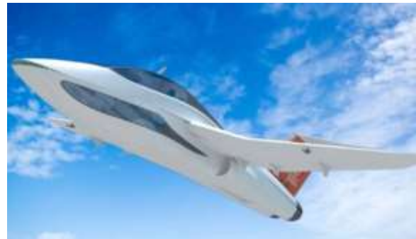
Fig. 32: The Samad Aerospace tells us that it has managed to develop a new two-seater VTOL concept, the Q-Starling

Rolls-Royce earlier created an M250 hybrid power system and performed ground tests. The APUS i-5 aircraft will now be used to demonstrate its integration with an aircraft.