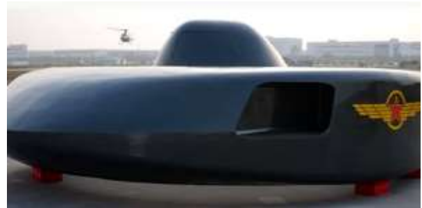
Fig. 49: Weirdest is e new aircraft. China briefly presents a new special, secret, prototype with UFO shapes, with special capabilities

China briefly presents a new special, secret, prototype with UFO shapes, with special capabilities (Fig. 49).