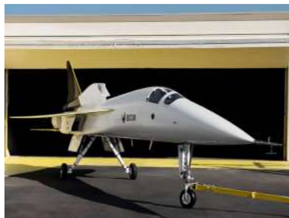
Fig. 24: Test flights with the little XB-1 will start in 2021

Boom XB-1 or Baby Boom has a length of 21.6 m and is built around a composite carbon fiber frame. Propulsion is provided by 3 General Electric J85-15 engines, designed to provide 12,000 pounds of thrust. It is important to note that the J85 is a long-range engine on the market since the 1950 s, but it seems to have been optimized to minimize the polluting impact on the environment.