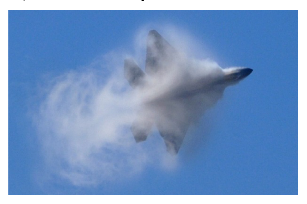
Fig. 1: Plasma stealth cloud

Achieving these aforementioned objectives would theoretically keep the jet stealthily in the presence of a quantum radar. The capability to enshroud a supersonic jet with a plasma stealth cloud already exists (Fiszer and Gruszczynski, 2002) and Lockheed Martin already have a patent on a military grade quantum radar (Brandsema et al. , 2014; Allen and Karageorgis, 2008).