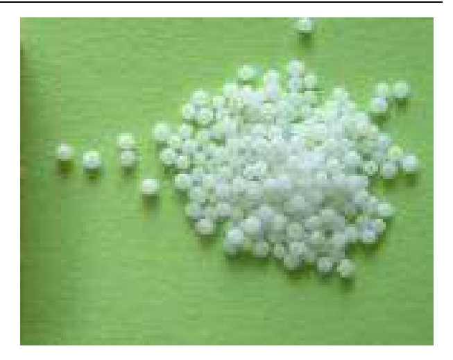
Fig. 2. Homeopathic pills, homeopathic preparation

From these symptoms, the homeopath chooses how to treat the patient using materia medica and repertories. In classical homeopathy, the practitioner attempts to match a single preparation to the totality of symptoms (the simlilum), while "clinical homeopathy" involves combinations of preparations based on the various symptoms of an illness.