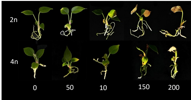
Fig. 1: Effects of NaCl stress on phenotype of A. andraeanum seedlings

The total root length of diploid and tetraploid A. andraeanum decreased as the NaCl concentration (Table 2) increased. At the NaCl concentrations of 150 mmol·L -1 and 200 mmol·L -1 , the total root lengths of diploid and tetraploid plants were significantly shorter than those of the control. In particular, at a NaCl concentration of 200 mmol·L -1 , the total root lengths of diploid and tetraploid decreased by 77.95 and 55.81% compared with the control. This shows that the effect of NaCl concentration on the root system of tetraploid was less than that of diploid.