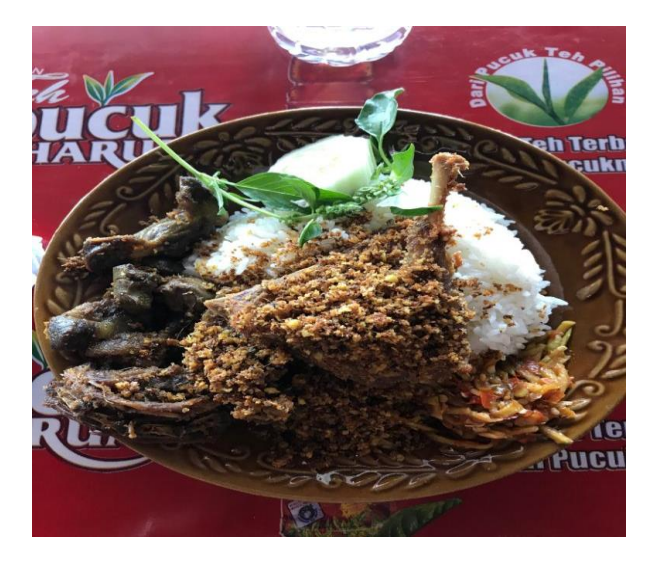
Fig. 3: Fried duck dish as the final product

The value-added was analyzed by following the Hayami et al. (1987) method showed that the obtained conversion factor is 1.0, which is calculated from the output and raw material during the distribution. The output value is calculated by multiplying the output price with the total output. The obtained output value in this study was IDR 920,000,000 at the ratio of 47%, thus the obtained added value was IDR 432,400,000. Moreover, the result of this study showed that value-added at the fried duck restaurant was higher compared to the duck farmer, distributor, or supplier. This indicates that the distribution activity at the fried duck restaurant was better compared to other activities by other distribution participants in the supply chain. The result of supply chain analysis in this study is different from the supply chain analysis of honey products by Qashiratuttarafi (2018), which showed that the highest value-added was obtained by packaging and distribution activity by the marketing outlet (supplier) with the added value ratio at 64%.