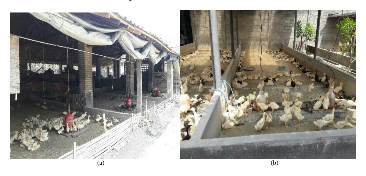
Fig. 2: The overview of duck farm in distribution Channel 1 (a) and Channel II (b)

This finding probably because most of the duck farmers are joined in the farmers' association so that they have good position in the supply chain. Moreover, the current result is probably also related to the relatively short supply chain of the duck meat, added with the condition that the farmers reared their ducks independently, so the transaction costs can be suppressed. Besides, the risk factors are excluded from this study, while in this supply chain farmers would suffer the highest risk due to the unstable price of farming materials (feeds, medicine, etc.) as well as the farming failure (sickness, low production, or high duck mortality).