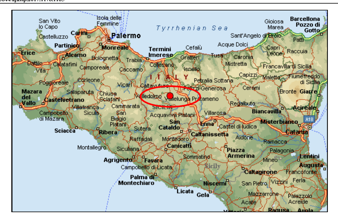
Fig. 1: "Pomodoro siccagno" cultivation area under survey

The third and last part concerns the management and commercial aspects (market-product system, commercial strategy, firm mission, planning, management control) and the activities related to marketing, research, purchase and sales. We have gathered data for a precise period: the 2012-2016 years for the productive and commercial aspects and the year 2016 for socio-structural aspects.