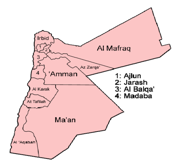
Fig. 1: Location of Governorates in the Hashemite Kingdom of Jordan

Study area: Al-Balqa Governorate is one of twelve governorates in the country of Jordan as shown in Fig. 1. Al- Balqa Governorate is located northwest of the capital city Amman with an area of 1076 Km<sup>2</sup> and population of 349,580 as of 2007 statistics (Department of Statistics, 2007).