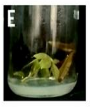
Fig. 1: Cassava plantlets with various concentrations of fusaric acid (A) 0 ppm "Control", (B) 60 ppm, (C) 80 ppm, (D) 100 ppm and (E) 120 ppm