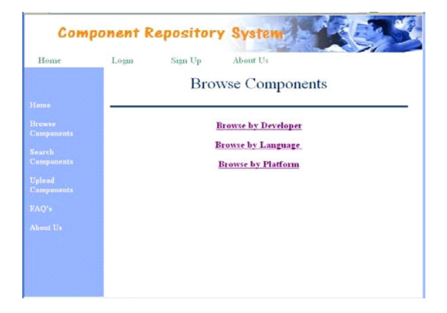
Fig. 3: Screen for browsing components