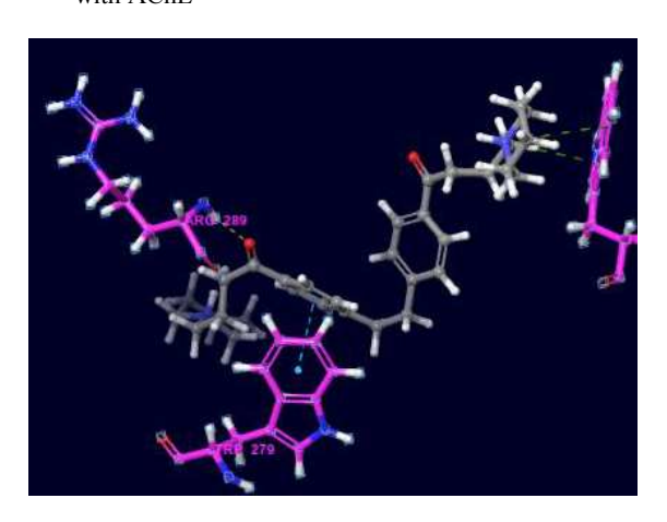
Fig. 3: Three-dimensional docking model of compound 2.3 with AChE