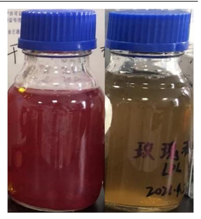
Fig. 2: Rose extract solution (left) and rose vinegar (right)

The determination results of protein, lipid, carbohydrate, sodium, and other essential nutrients and energy in the rose vinegar were summarized in Table 1. The main component of the rose vinegar was water. The contents of energy, carbohydrate, and sodium were 70.8 kJ/100 mL, 4.9 g/100 mL, and 17.8 mg/100 mL, respectively. Compared with other vinegar drinks, this rose vinegar was low in carbohydrates and energy, making it suitable for daily drinking.